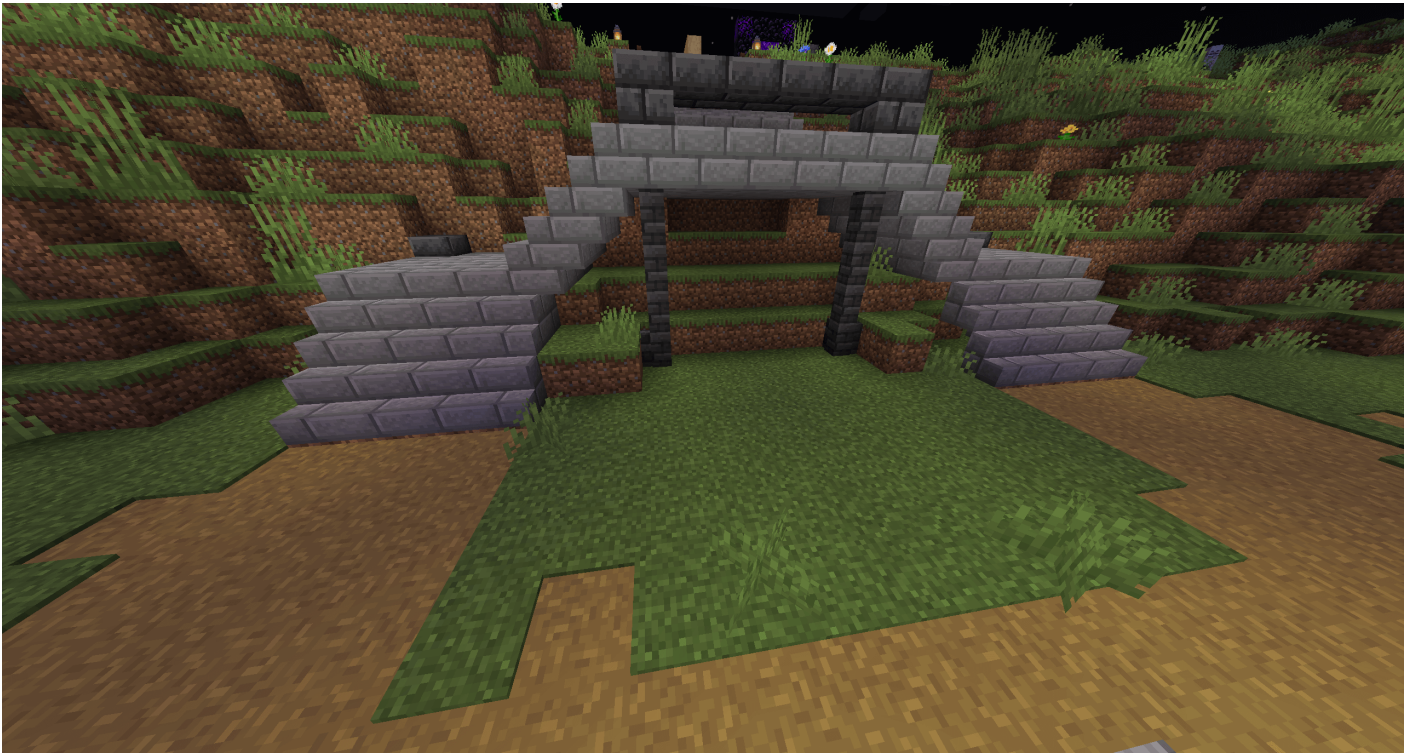
Public building area